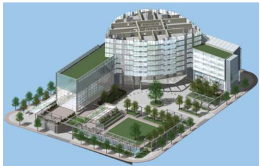
Rear Axio Cut View